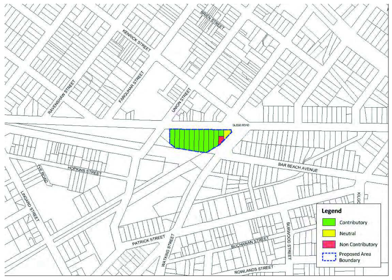
Figure 7.4 - Proposed Glebe Road Heritage Conservation Area - contributory buildings map

Contributory buildings may be defined as those buildings that are part of the original building stock, or have historic or aesthetic significance, or make a positive contribution to the streetscape. Generally buildings in this category had not been heavily altered or where alterations were evident these were of a scale or style that retained the character of the building. Removal of contributory buildings is detrimental to the heritage conservation area because these elements establish the prevailing character and reinforce its sense of place. On the other hand, demolition of and alterations to non-contributory buildings is encouraged if the replacement design is more in character with the streetscape. The contribution of any particular building to streetscape, character or heritage significance will guide the approach to development and assist in determining the degree of change that will be permitted.